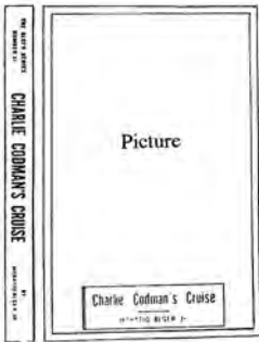
S-5 Lettering On