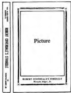
S-4 Corner X