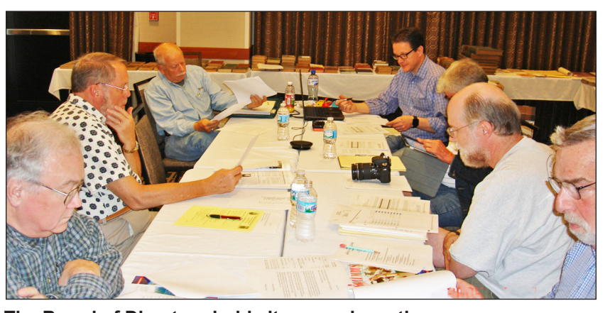
The Board of Directors holds its annual meeting.